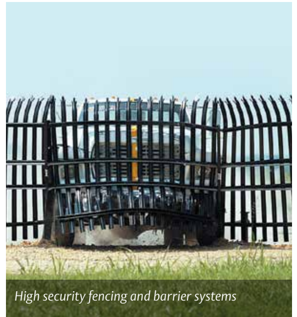
High security fencing and barrier systems

Whether your facility is a large military installation, a Veteran Affairs Medical Center, or a singular government building, ASSA ABLOY ensures every opening is properly protected. This includes perimeter gates/fencing and traditional, specialty blast, ballistic, and acoustic doorways, as well as interior cabinets and data closets. Careful consideration of each opening based on usage and risk allows for the proper selection of access control, enhancing the security of your facility while keeping costs in line.