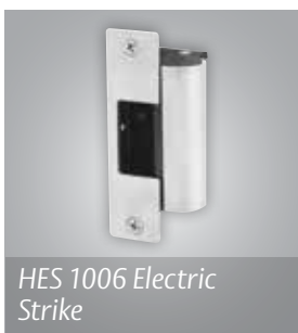
HES 1006 Electric Strike