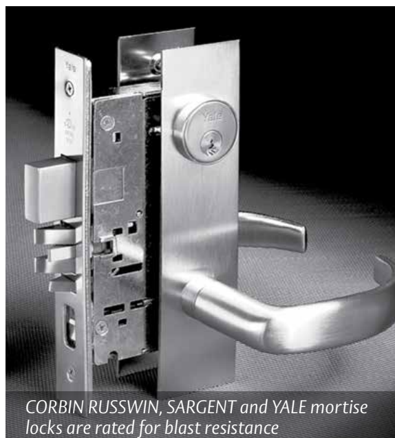
CORBIN RUSSWIN, SARGENT and YALE mortise locks are rated for blast resistance