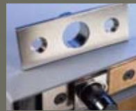
Bottom Bolt 3/4" diameter steel with 3/4" projection