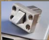
Top Latch 5/8" stainless steel housings, 3/4" projection with 1/8" door gap