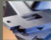
Center Bolt Strike 1/4" stainless steel strike versus 1/8" standard wrought strike