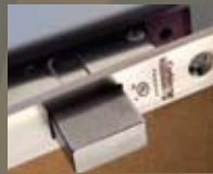
Center Bolt Stainless steel deadbolt with 1" projection