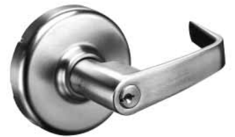
CL3500 Newport Lever; NZD