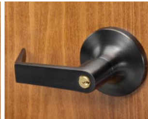
722 Finish Black Oxidized Bronze, Oil Rubbed Effective May 1, 2010 (Previous 613 designation)