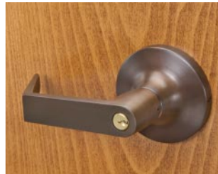
613 Finish Dark Oxidized Satin Bronze, Oil Rubbed Effective May 1, 2010 (New)