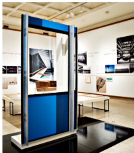
Mock-up of curtain wall for the IBM facility as seen in the exhibition. Eero Saarinen: Shaping the Future , Cranbrook Art Museum, Bloomfield Hills, Michigan November 17, 2007 through March 30, 2008.