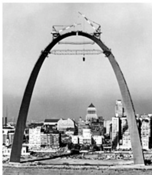
Construction, United States Jefferson National Expansion Memorial (1947-65), St. Louis, Missouri, 1965

After a successful North American opening at the Cranbrook Art Museum in Bloomfield Hills, Michigan, Eero Saarinen: Shaping the Future is headed to Washington, DC.