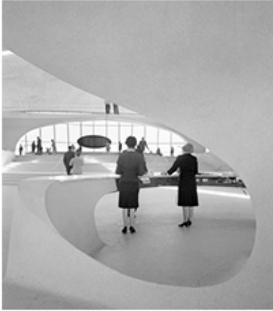
Information Desk, John F. Kennedy International Airport, circa 1962